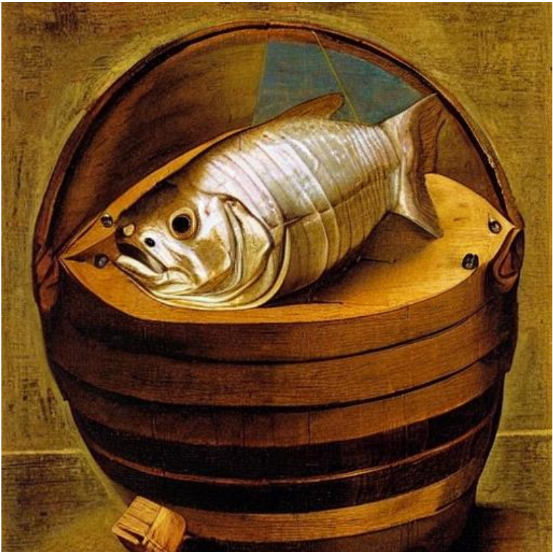
Dried or silted, a herring is a lovely treat. Soon, it may become difficult to acquire.

Escape the mundane and embrace an otherworldly retreat at Verdant Acres, a haven nestled within the Evershroud Isles. Step into a realm of serenity, where tranquility is orchestrated by the timeless grace of the undead hosts. Relish in opulent relaxation at our luxurious spa and resort, meticulously overseen by the undead proprietors. Immerse yourself in the rejuvenating mineral baths, where ethereal mists mingle with the soothing warmth of the waters. Nestled amidst breathtaking landscapes, Verdant Acres offers a tapestry of natural wonders. Stroll through meticulously tended gardens that flourish under the care of our spectral gardeners, ensuring an evergreen splendor year-round. Verdant Acres. No one ever leaves.