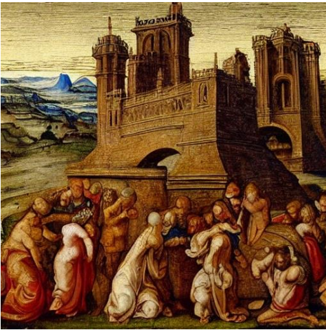
The People of Silt in particular are struck with grief at the Sovereign’s passing, having been closely interwoven with the Brine Alcazar’s affairs.

Yet, amidst this perceived crisis, voices of optimism resonate. Advocates for change see this moment as an opportunity to redefine the governance structure, fostering greater equality and representation across the diverse populace of the Isles.