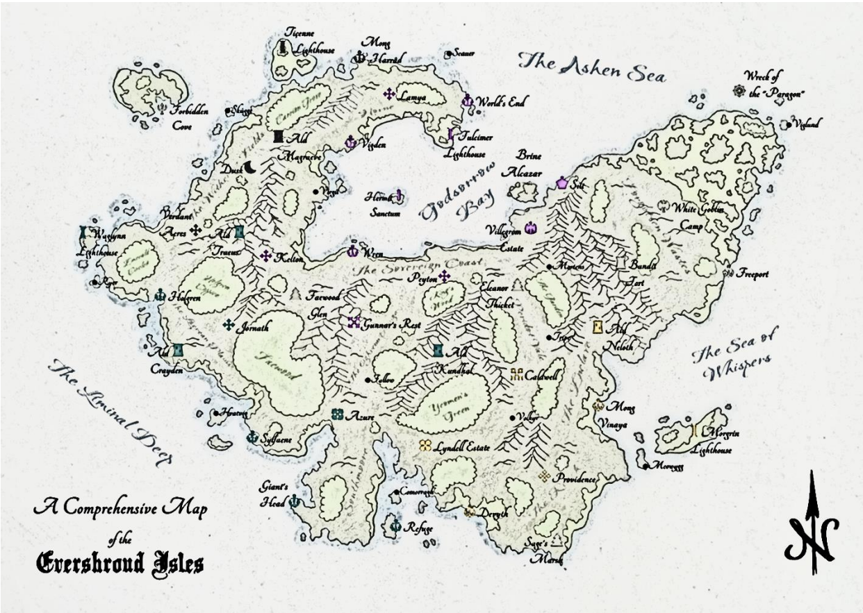
The Evershroud Isles’ Political Divison; Margraeve, Azure, Silt, Caldwell and the Freeholds