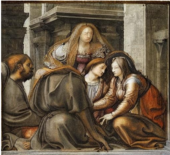
The Sovereign's family weep at his most unfortunate passing, uncertain of the times to come.

The Evershroud Isles mourn the passing of a revered leader, Sovereign Justin Hibbert Nekator IV, who peacefully departed this realm at the age of 83. His Eminence's tenure spanned decades, marking an era of stability and progress for our lands. The somber toll of bells echoed across the Isles as news of his passing spread like wildfire, touching hearts from Silt's salt-sprayed shores to the farthest reaches of the Azurean League. (Cont. page 2)