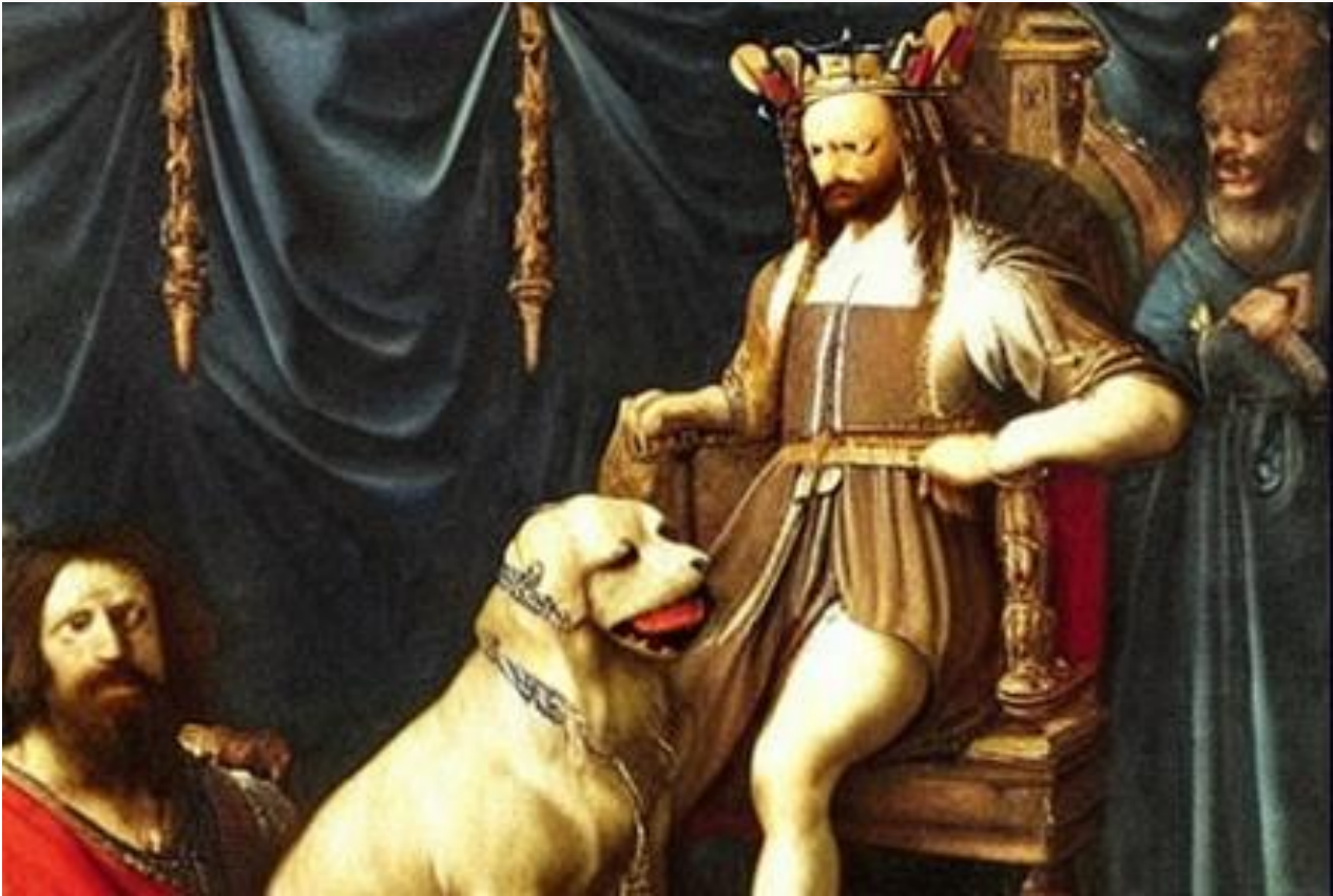
His Late Majesty with his faithful doggo Hvitserk, as committed to the canvas for his inauguration